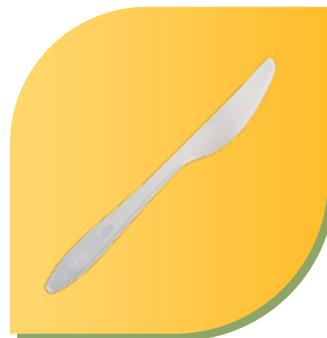
Compostable knives Custom color available