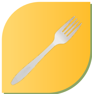
Compostable forks Custom color available

40 billion plastic forks, knives and spoons are used every year in the USA. Evanesce's cutlery looks and feels like plastic but are made from plant-based biopolymers that are certified compostable. Serve your takeout and meals-to-go without adding plastic waste.