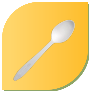
Compostable spoons Custom color available