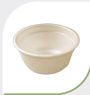
Bowls 8 / 12 / 16 oz