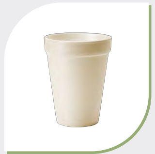
Hot or cold cups 12 / 16 / 20 / 24 / 32 oz

Laminated and unlaminated varieties. Custom products and configurations available. Minimum quantities apply.