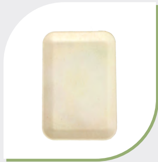
Trays Standard Food Industry Sizes

Say goodbye to EPS foam trays, bowls, takeout containers, and serviceware items. Choose our 100% compostable plant-based packaging technology that costs less than other eco-friendly single-use serviceware alternatives and decomposes in 90 days or less.